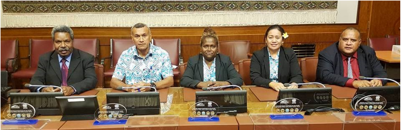
The ASMP Member countries at this years Review: PNG, Fiji, Solomon Islands, Samoa and Vanuatu.

The ASYCUDA Support Mechanism for the Pacific (ASMP) office marked 15 years of its existence by having its 2016 Annual Review at the UNCTAD headquarters in Geneva, Switzerland.