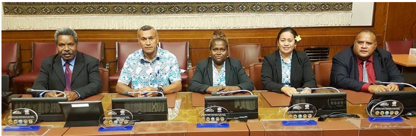
The ASMP Member countries at this years Review: PNG, Fiji, Solomon Islands, Samoa and Vanuatu.

The ASYCUDA Support Mechanism for the Pacific (ASMP) office marked 15 years of its existence by having its 2016 Annual Review at the UNCTAD headquarters in Geneva, Switzerland.