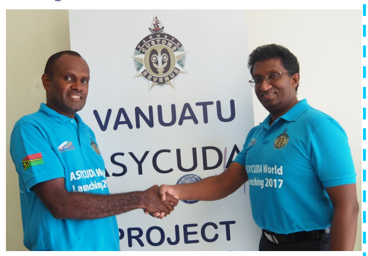
Project Manager welcoming the AW Expert into the Team

The AW Expert is already busy working with the Team as there are still a lot of work to be done to ensure a successfully implementation of the system come 5th of June.