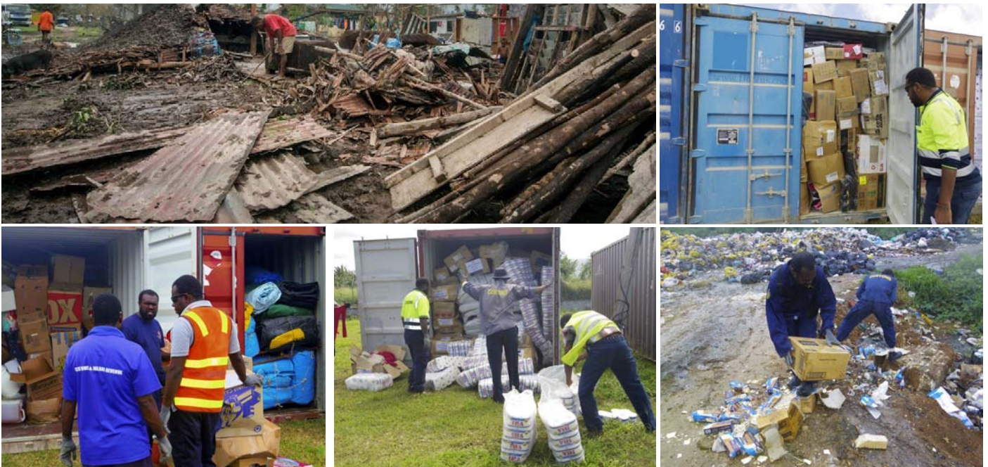
Dealing with UBD's, two years after TC Pam:

Customs is already having talks with the NDMO to improve facilitation of disaster relief supplies in the future and to put in measures in place to minimize the issue of UBD's.