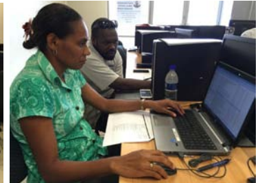
The Documenting, Testing, Trainers team